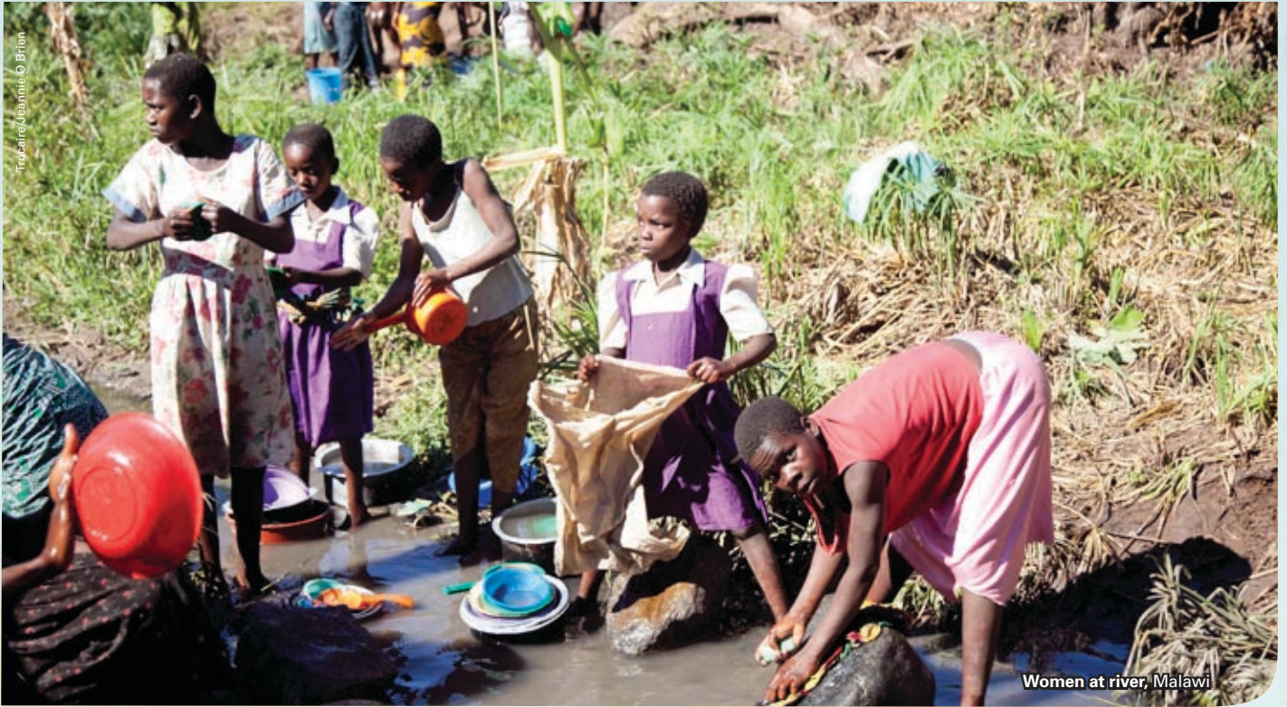
Women at river, Malawi