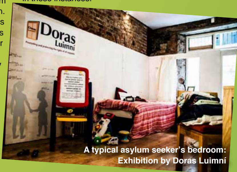
A typical asylum seeker's bedroom: Exhibition by Doras Luimní

Asylum seekers can be supported in their participation in intercultural events in the school. It should be remembered that practical issues such as the timing of events, access to cooking facilities and limited funds can all impact the degree to which an asylum seeker student or parent can engage with a school event. It should also be remembered that asylum seekers who have experienced trauma may be reluctant to talk about their life in their country of origin or share some of their cultural practices in these intercultural events as a result. Teachers can be guided by parents in these instances.