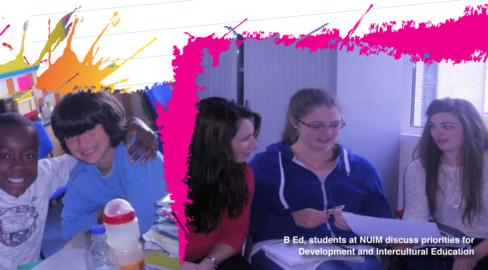
B Ed, students at NUIM discuss priorities for Development and Intercultural Education

It must also be remembered that schools often have diversity among the wider staff in the school. In order to promote a truly whole-school approach to interculturalism, these staff members can be central to event planning and development.