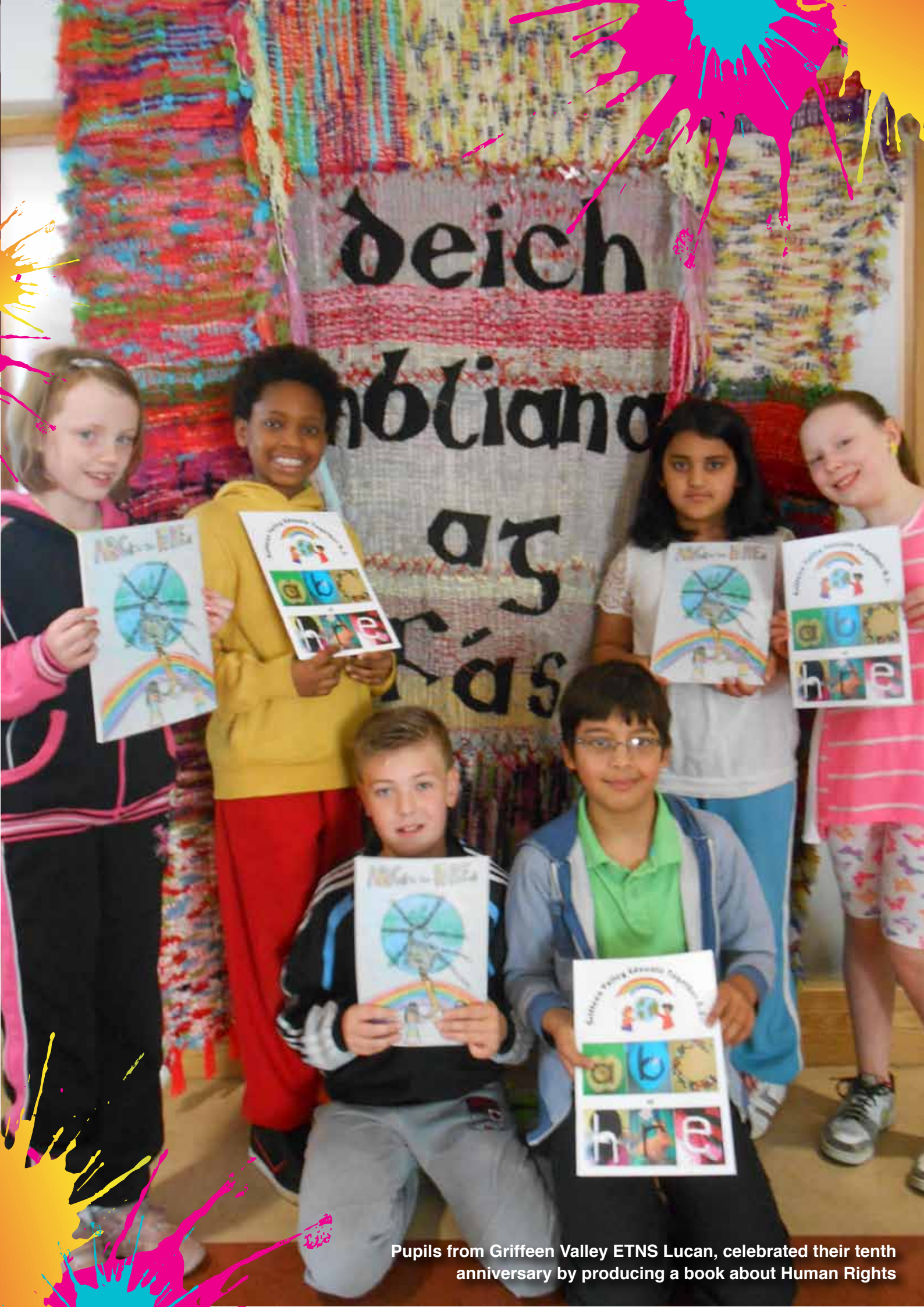
Pupils from Griffeen Valley ETNS Lucan, celebrated their tenth anniversary by producing a book about Human Rights