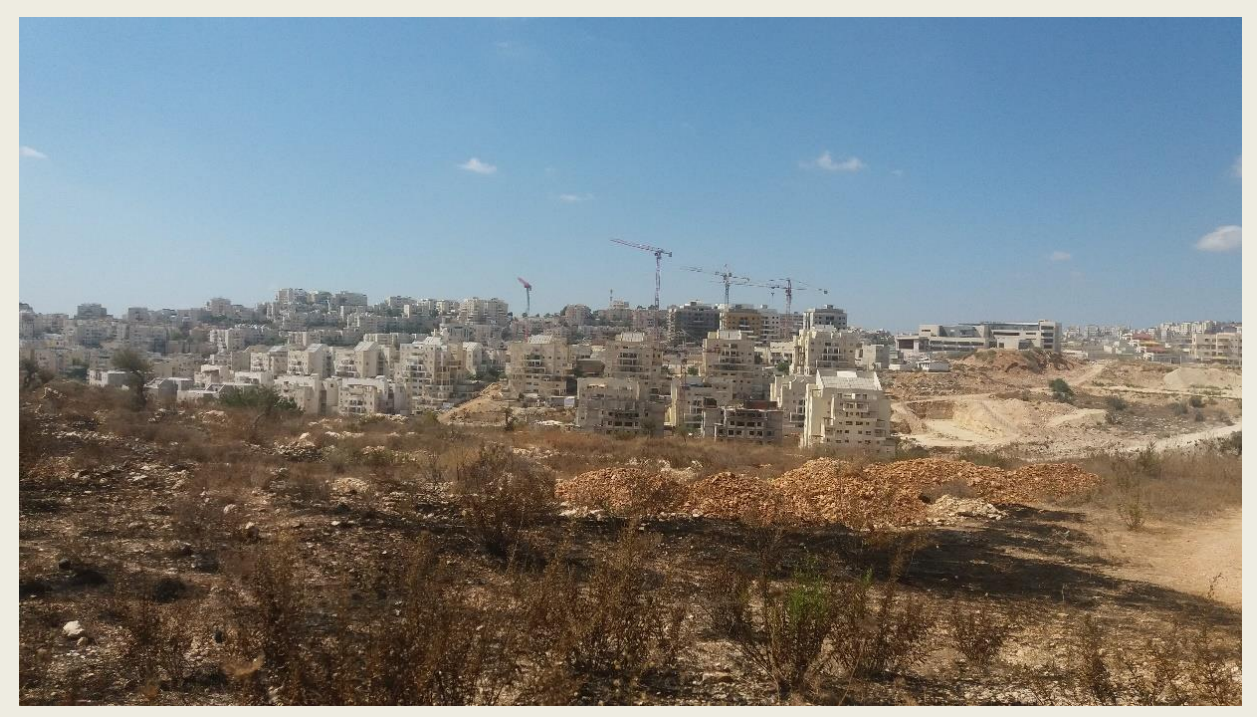
A settler colony overlooking the village of Bil'in

a call for a '<u>civil targeted killing</u>'. Israel's ramping up of aggression toward BDS and its leaders is due to the recent successes of the movement in persuading multinational giants <u>Veolia</u> and <u>G4S</u> to abandon their investment in Israel. A current priority target is <u>Hewlett Packard</u> which supplies the IT equipment used for gathering biometric data at checkpoints. Irish activists have been among the first to embrace BDS and helped to secure the withdrawal of Irish corporation Cement Roadstone Holdings from its complicity in the construction of the Separation Barrier. Where more work is needed, however, is in the implementation of sanctions particularly by the European Union, which is Israel's biggest trading partner under the auspices of an <u>Association Agreement</u>. More pressure is needed on European Union institution's and member governments to have this pivotal agreement suspended pending Israel's compliance with international law. The giant strides already made by BDS show that this is within our compass. Similarly, the United States, which recently pledged <u>$38bn</u> in military aid to Israel over the next ten years, needs to end its seemingly unconditional diplomatic, military and financial support of Israel if significant headway is to be made in advancing meaningful dialogue toward peace.