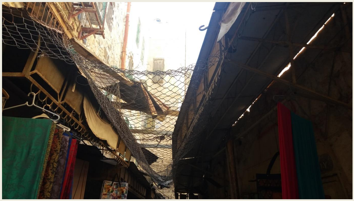
A wire mesh captures debris thrown from settlements on to the Palestinian market below in Hebron

area of the old town where Palestinian commercial life carries on we found the market protected from above by a wire mesh that gathered debris thrown down from above by settlers. The proximity of settlers, often armed and attended in any event by a heavy military presence, makes a nonsense of the <u>area demarcations</u> outlined by the Oslo Peace Accords. Hebron, for example, is part of Area A designated by Oslo as residing under the control of the Palestinian Civil and Security Authority, but in reality Israel's domain holds forth. Human rights organisations have raised concerns about settler and military impunity in carrying out abuses against Palestinians. For example, Amnesty International's 2015-16 <u>report</u> found that: 'Israelis living in illegal settlements in the occupied West Bank frequently attacked Palestinian civilians and their property, sometimes in the presence of Israeli soldiers and police who failed to intervene'. Moreover, 'since 1987, no Israeli soldier or commander has been convicted of wilfully causing the death of a Palestinian in the Palestinian territories'.