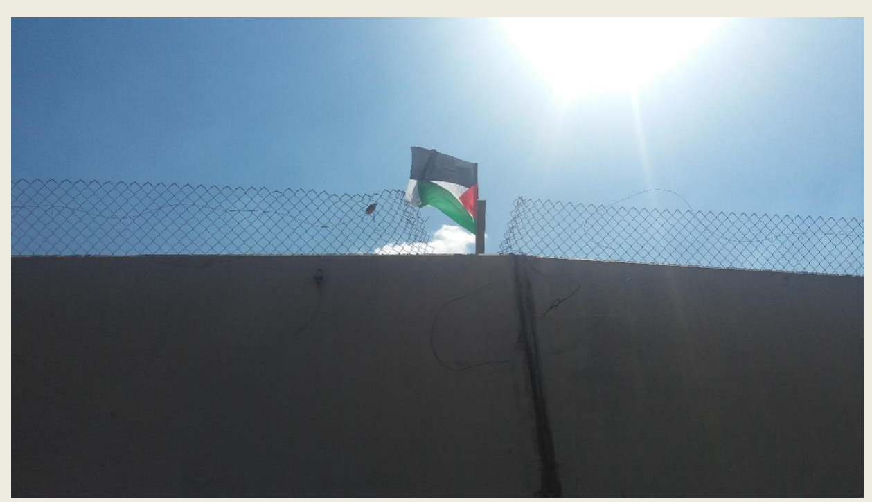
A Palestinian flag flies aloft the wall in Bil'in

"Ultimately, Israel is intent on not just colonizing our land but also our minds, searing into our consciousness the futility of hope and the impossibility of resisting its hegemonic and unjust order. Hope, after all, can be contagious. Despite decades of dispossession, occupation, and brutalities, Palestinians have not given up; we continue to resist oppression and to assert our quest for equal rights to all humans".